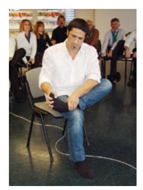
Massage the foot 1. Hold the ankle and turn the foot slowly left and right. 2. Let follow the hands what it feels good.