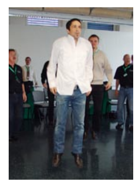
...and jump 3x and exhale.