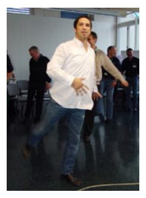
Swing the leg If you put a book under the standing feet, you can relax better the hip.

Bird starts to fly 1. Stand on one foot and stretch the hands out and circle the hands and foot 10x to the left and right. BREATH. 2. Repeat on the left and