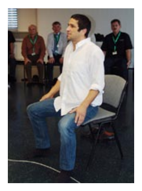
Circling the shoulders Make a big slowly circle with the shoulders and let the breath come in and out naturally. Back and forward.