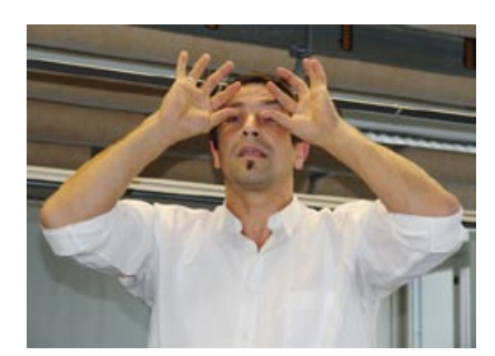
6. Massage the eyes.