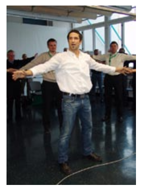
3. Breath out slowly until the lungs are empty.