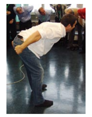
4. Hit yourself with the loose fist from the back to the feet and go to the front of the feet and still hitting yourself go up to the head.