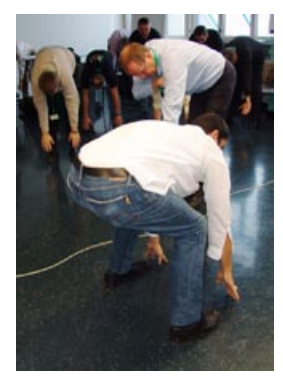
3. Now you have to breath out.