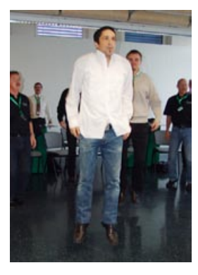
Jumping 3x and exhale when you land on your feet and relax the shoulders.