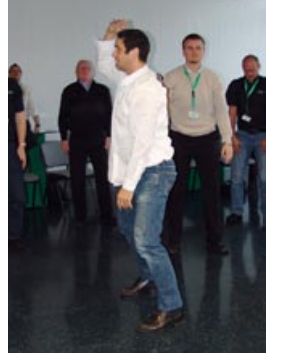
5. Bring the head straight up and restart with the exercise by stretching the hands up and breathing in. Repeat 3 - 5 x slowly with the rhythm of your breathing.