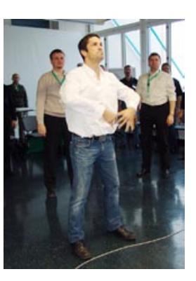
1. The bird starts to fly.

Breath always during the exercises. "IN" through the nose and exhale "OUT" through the mouth.