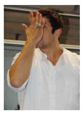
King Kong is awake 7. Massage the nose. 8. Glide with your hands all over your body from the head to the toes...and then shake your hands...