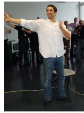
2. Hit with the fist inside and out side of your arms. Left and right.